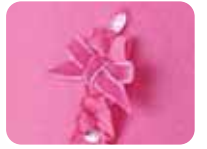
Style D4354 Long Sleeve Top As Sample – Cerise 12m, 18m 2yr, 3yr, 4yr, 5yr, 6yr 95% Cotton, 5% Spandex