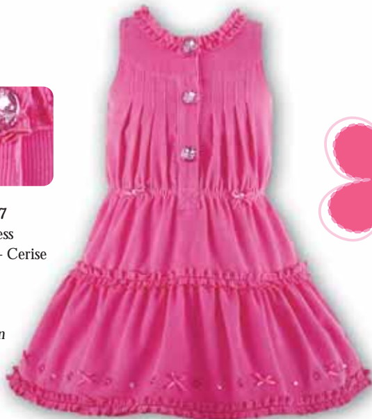
Style D4357 Pinafore Dress As Sample – Cerise 12m, 18m 2yr, 3yr, 4yr 5yr, 6yr 100% Cotton