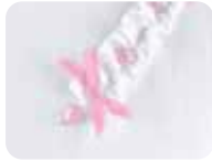
Style D4364A Long Sleeve Top As Sample – White/Pink 3m, 6m, 12m, 18m 2yr, 3yr, 4yr 95% Cotton, 5% Spandex