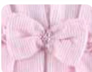
Style D4366A Pinafore Dress As Sample – Pink 3m, 6m, 12m, 18m, 2yr, 3yr, 4yr Outer: 100% Cotton Lining: 67% Polyester, 33% Cotton