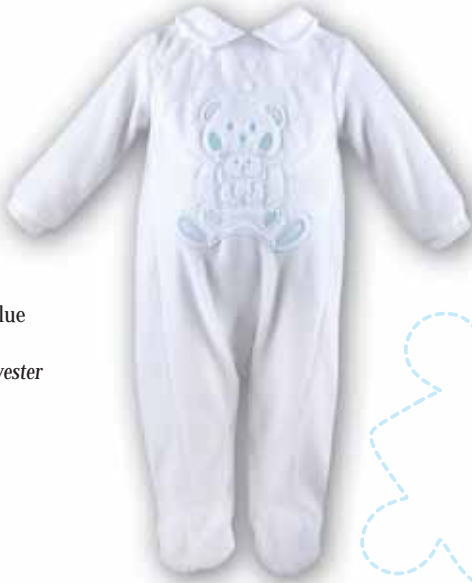
Style D4335 Velour – All In One As Sample – White/Blue Prem, NB, 3m, 6m 80% Cotton, 20% Polyester