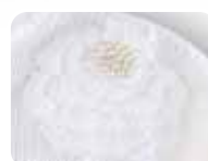
Style D4362 Cardigan Cerise, Ivory, Pink, White 3m, 6m, 12m, 18m, 2yr 3yr, 4yr, 5yr, 6yr 100% Acrylic