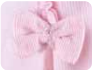
Style D4365A Trouser As Sample – Pink 3m, 6m, 12m, 18m 2yr, 3yr, 4yr 100% Cotton