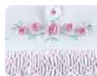
Style D4361L / D4361S Dress Pink, White 3m, 6m, 12m, 18m, 2yr 65% Polyester, 35% Cotton