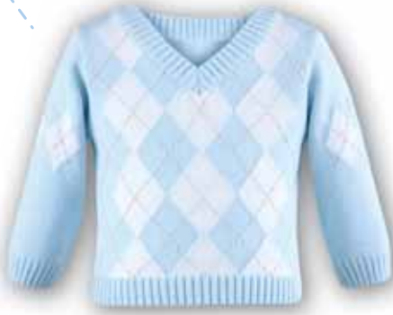
Style D4339 Sweater As Sample – Blue/White 6m, 12m, 18m, 2yr, 3yr 100% Acrylic