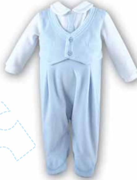
Style D4336 Velour – All In One As Sample – Blue/White Prem, NB, 3m, 6m 80% Cotton, 20% Polyester