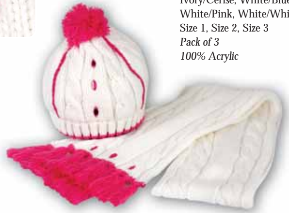
Style D4350P Hat & Scarf Ivory/Cerise, White/Blue White/Pink, White/White Size 1, Size 2, Size 3 Pack of 3 100% Acrylic