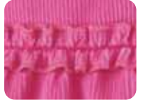
Style D4355 Skirt As Sample – Cerise 12m, 18m 2yr, 3yr, 4yr 5yr, 6yr 100% Cotton