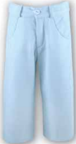
Style D4341 Trouser As Sample – Blue 6m, 12m, 18m, 2yr, 3yr 100% Cotton