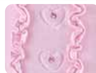
Style D4360 Velour –All In One Pink, White Prem, NB, 3m, 6m 80% Cotton, 20% Polyester