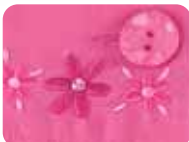
Style D4352 Coat & Hat Cerise, Pink 12m, 18m, 2yr, 3yr, 4yr, 5yr, 6yr Outer & Fill: 100% Polyester Lining: 100% Polyester Backing: 100% Nylon