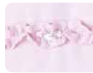
Style D4368 Jacket Pink, White 3m, 6m, 12m, 18m, 2yr, 3yr Outer, Lining & Fill: 100% Polyester