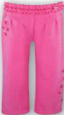
Style D4356 Trouser As Sample – Cerise 12m, 18m 2yr, 3yr, 4yr 5yr, 6yr 100% Cotton