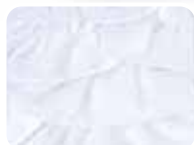
Style D4346 Jacket Pink, White 3m, 6m, 12m, 18m, 2yr, 3yr Outer & Fill: 100% Polyester Lining: 80% Cotton, 20% Polyester