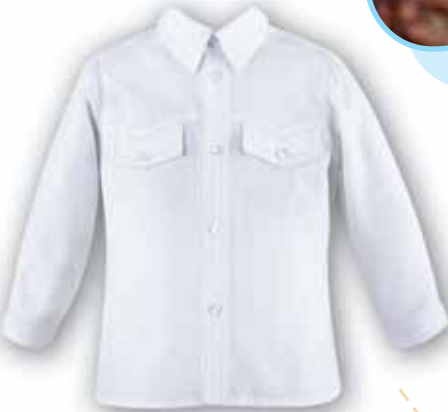
Style D4340 Shirt – Twill As Sample – White 6m, 12m, 18m, 2yr, 3yr 50% Cotton, 50% Polyester