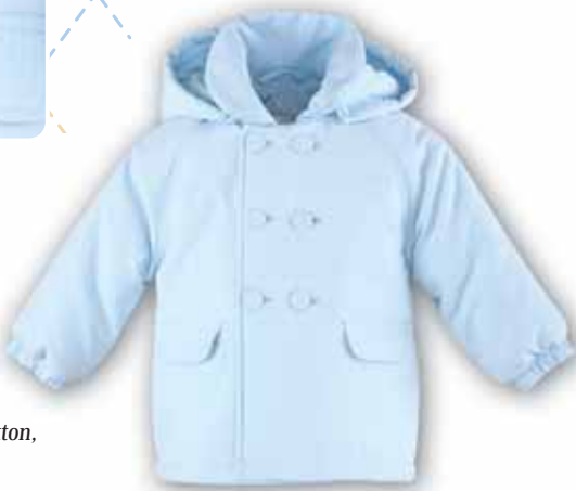
Style D4343 Jacket Blue, White 3m, 6m, 12m, 18m 2yr, 3yr Outer & Fill: 100% Polyester Lining: 80% Cotton, 20% Polyester