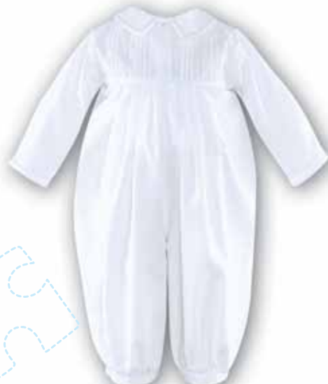
Style D4337 Romper Blue, White NB, 3m, 6m 65% Polyester, 35% Cotton