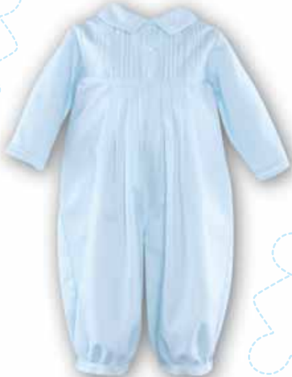
Style D4337 Romper Blue, White NB, 3m, 6m 65% Polyester, 35% Cotton